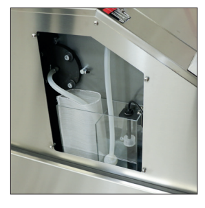
Oil recycling system Reduces oil consumption. Fitted with a filter and a low level