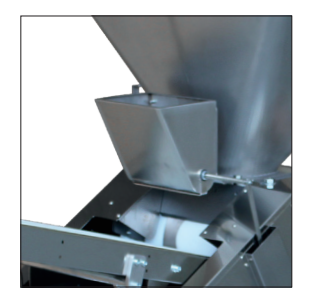
Built-in flour dispenser Prevents the dough pieces from sticking to the belt.