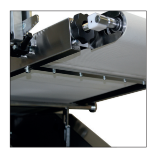
Outfeed belt scraper The belt is kept clean throughout use.