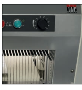
Variable speed drive Allows the cutting speed to be adjusted to suit the type of bread.

Motorised outfeed belt Fitted with adjustable guides to ensure that the bread is held together after cutting.