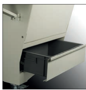
Two crumb collectors 8,7 gallons capacity each.