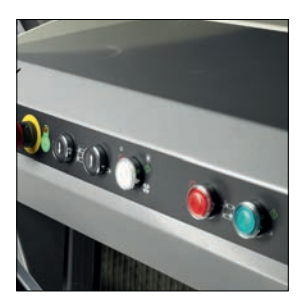
Front control panel Motorized adjustment of the upper belt height (height of loaves). Next to the front panel controls, a timer accurately records your working time.