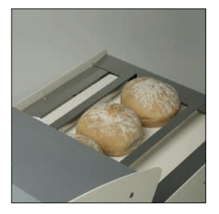
Rear loading belt Provides uniform continuous cutting, thanks to adjustable side guides.