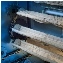
UV lamp and air extractor Germicidal UV lamp with protection and air extractor Sterilises the proofing area and extracts moisture. Hygiene Smooth inside walls Stainless steel exterior covers Flour recovery bins