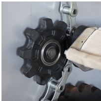
Bronze ring gear wheel Reduces friction and extends service life.