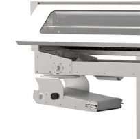
Unloading turret Can be swivelled 180°